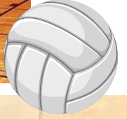
Physical Education Field Trip to the Lakeview Sports Centre!